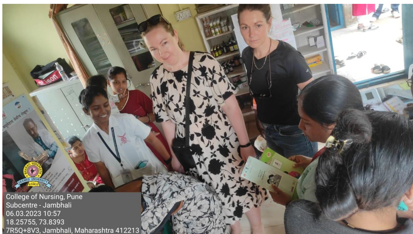
College of Nursing, Pune Subcentre - Jambhali 06.03.2023 10:57 18.25755, 73.8393 7R5Q+8V3, Jambhali, Maharashtra 412213

On 6th March 2023, Bharati Vidyapeeth College of Nursing, Pune Faculty Member & the students along with the international students from USN, Norway had visited rural Subcentre of Jambhali and Primary Health Centre of Karanjavane under Bhore Taluka of Pune district. They first visited the Subcentre of Jambhali, where the international students were oriented about the structure and layout of Subcentre. They were briefed about the population covered and the various functions being carried out for the village along with implementation of various national health programs. The students got the opportunity to observe the immunization program being performed. They got to know about the activities being carried out by the CHO, ANM and ASHA.