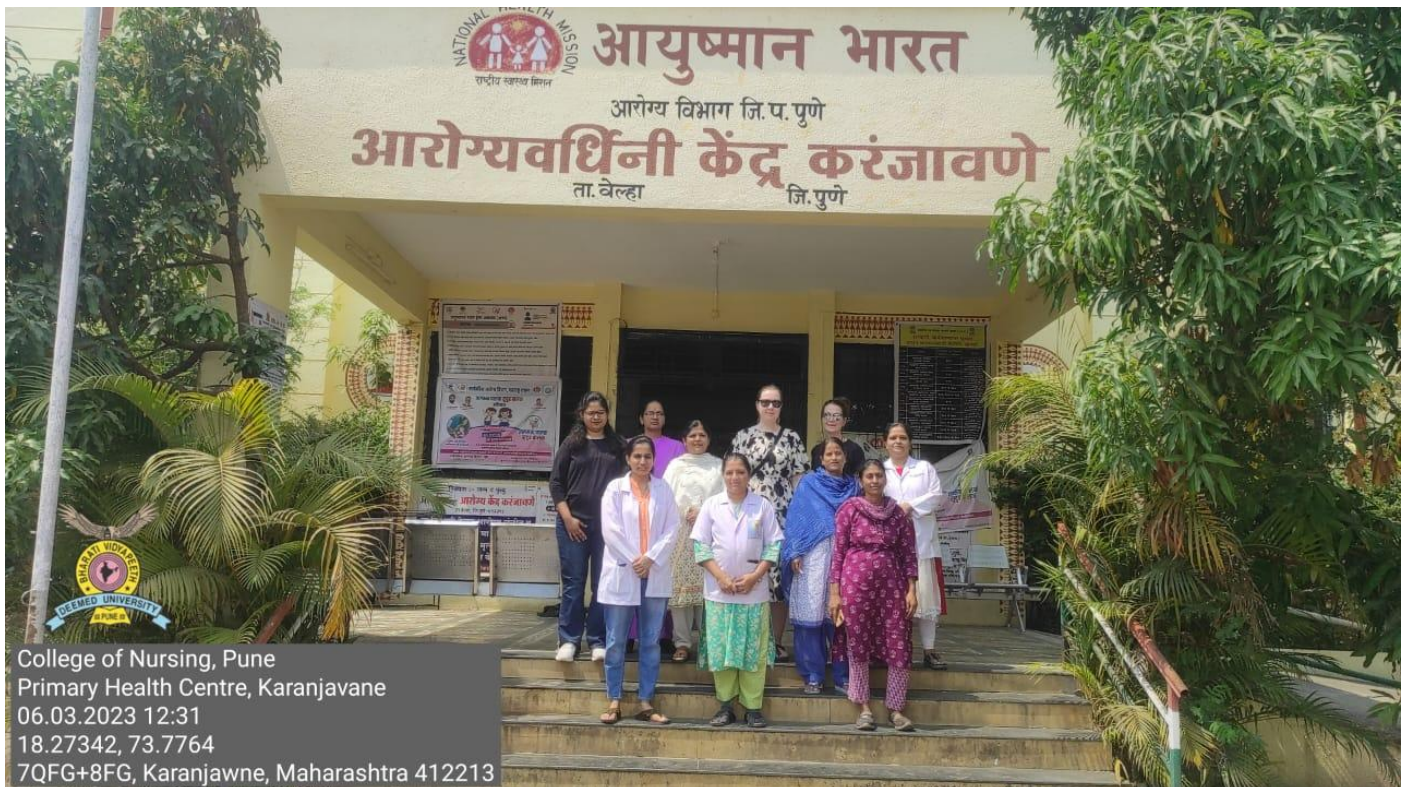
PRIMARY HEALTH CENTRE, KARANJAVANE