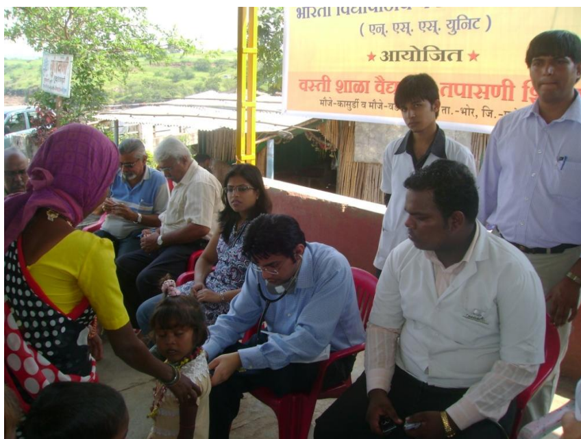
HEALTH CHECK-UP CAMP UNDER NSS