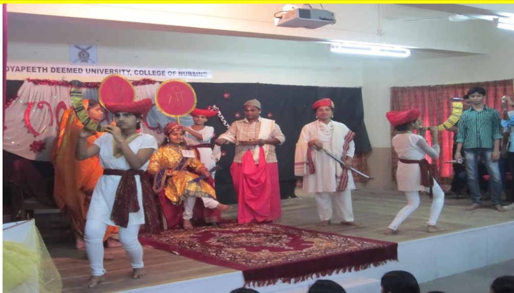
CULTURAL ACTIVITIES IN COLLEGE WEEK 2011