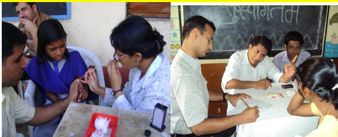
1. Free Medical Health Check-up Camp in Collaboration with NSS & Bharati Hospital Research Centre 2. Health Education to Nasrapur School Children by M.Sc. (N) Student