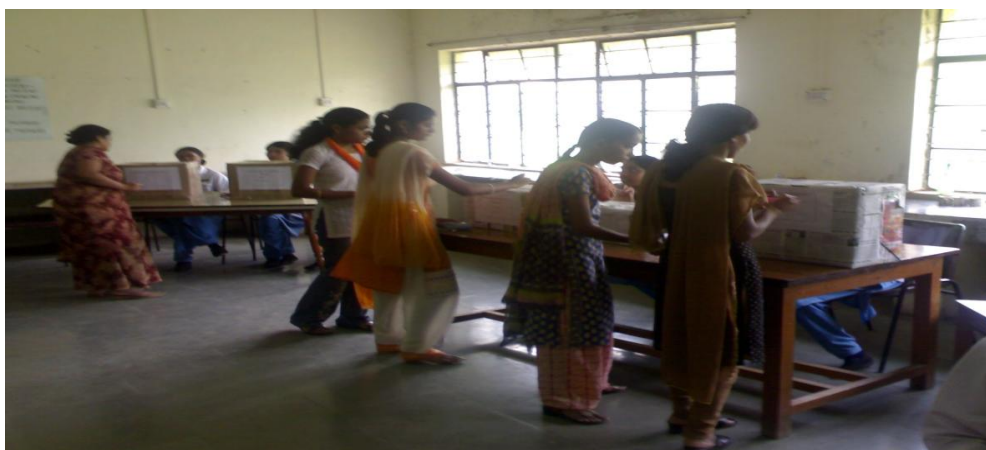
Student Nurses Association Election 2011

Continuation of all healthy practices in this academic year also which was undertaken in the previous years.