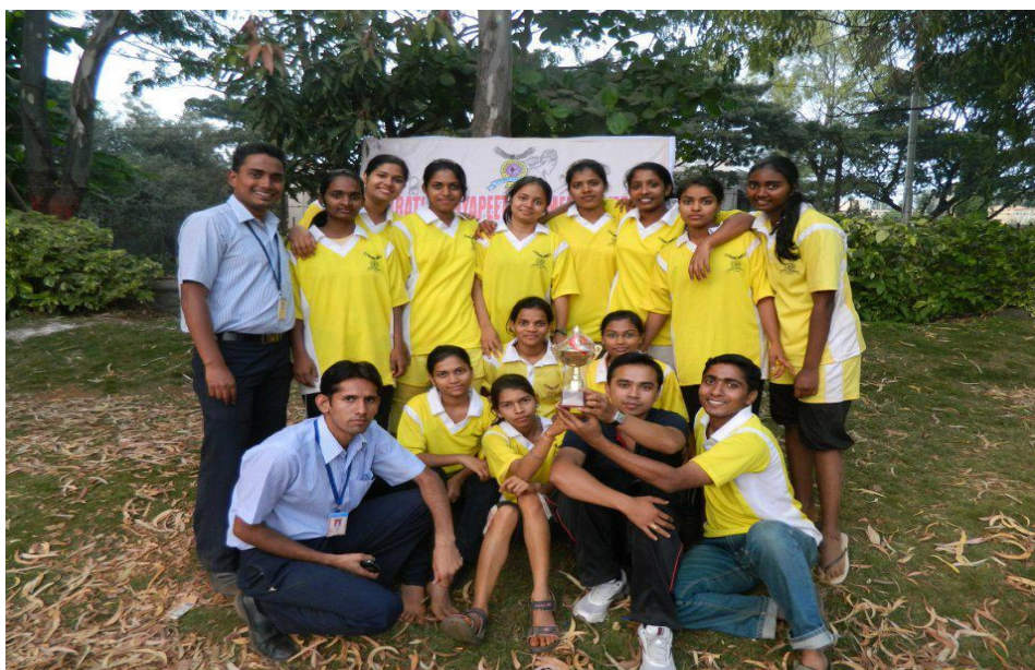
Intercollegiate Women's KHO-KHO Tournament – 2 nd Prize: 2012 (Organize by Physical College, BVDU)