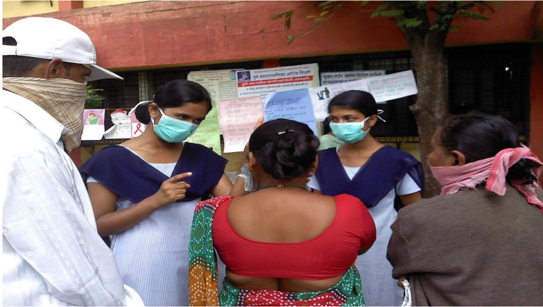
4th Year B.Sc. Nursing students Giving Health Education in Urban and Rural Community