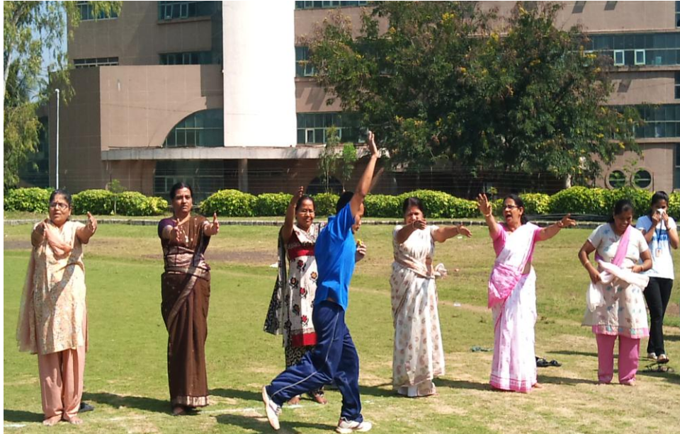
SPORTS ACTIVITIES DURING COLLEGE WEEK 2011 TEACHERS ARE PARTICIPANTS