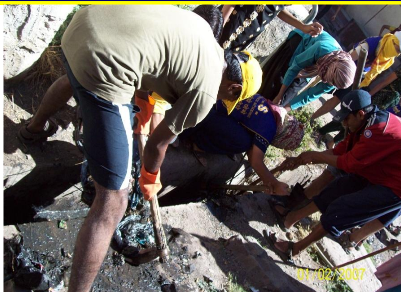
CLEANING OF DRAINS UNDER NSS 2011-12 AT KAPOORHOL VILLAGE